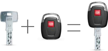
Two systems, one key.

nearly any and all DOM mechanical keys – you can expand our feature-rich digital experience to all your locks. Unify your mechanical and digital systems with ENiQ and unlock endless possibilities – your Digital Security Ecosystem by DOM.