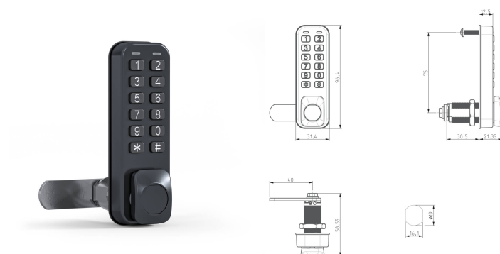
Long body - Vertical keypad