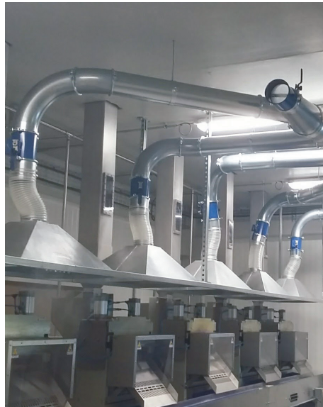
Extraction of oily fumes on rice cake presses

The purpose of industrial ventilation equipment is to combat pollution in work premises and workshops by reducing the quantity of contaminants with known or suspected effects on people.