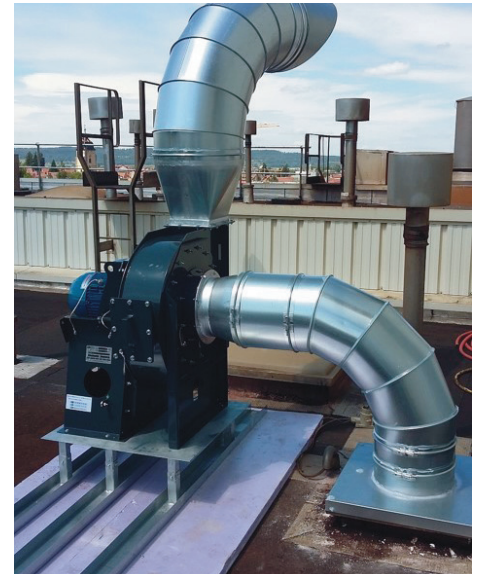
Extraction of pollutants with NEU FEVI Easy Air fan