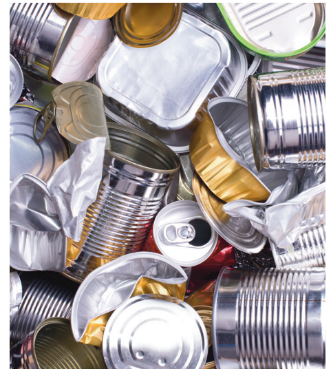
Beverage cans, scrap metal packaging

NEU-JKF produces waste capture at source systems to enable manufacturers to ensure staff safety (removing the need for manual gathering), to optimise processes and energy efficiency.