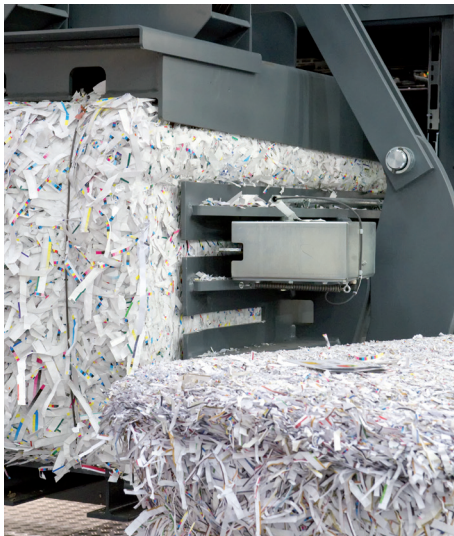
Paper, cardboard, ... waste