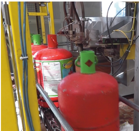
Transfer of labeling during gas cylinders reconditioning

Capture and conveyance of metal packaging waste