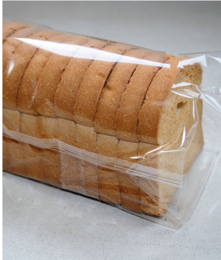
Bread, rusks and packaging waste

Solutions for process waste extraction: paper waste, cardboard, packaging, edge trims, print trim, metal packaging.