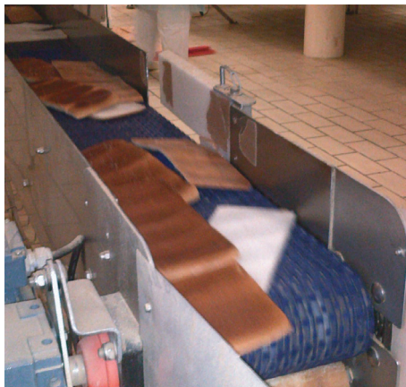
Transfer of bread crusts