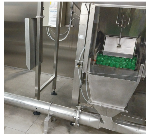
Transfer of caps