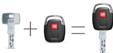
Two systems, one key.

any and all DOM mechanical keys – you can expand our feature-rich digital experience to all your locks. Unify your mechanical and digital systems with ENiQ and unlock endless possibilities – your Digital Security Ecosystem by DOM.