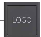
Your logo and/or locker number