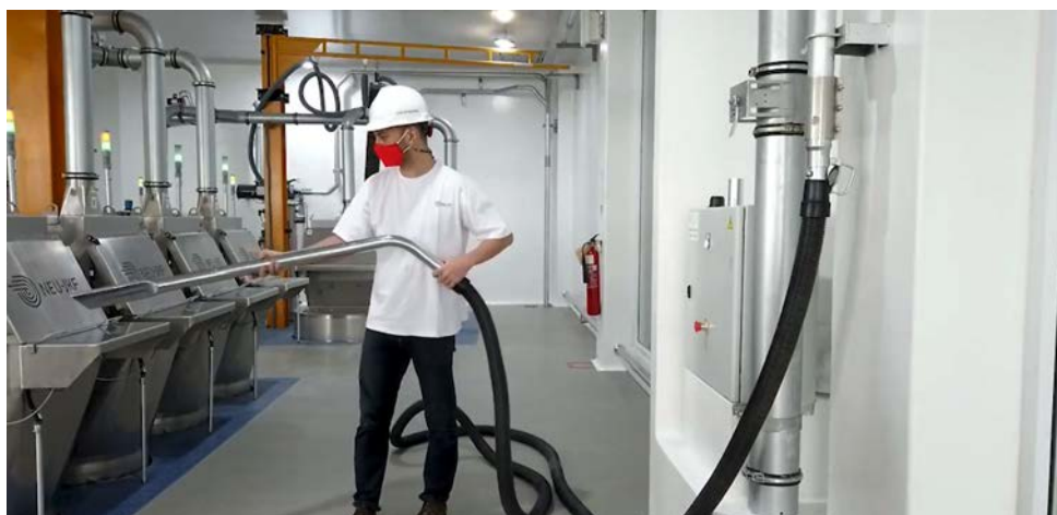
Work area cleaning