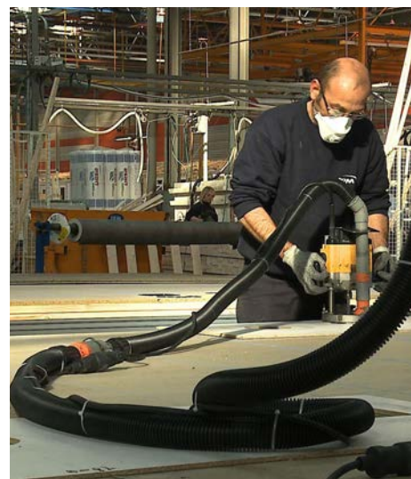
Vacuum at workstation

A Centralised Vacuum Cleaning System is used to :