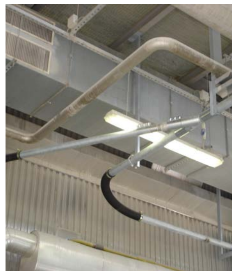
Suction pipe network