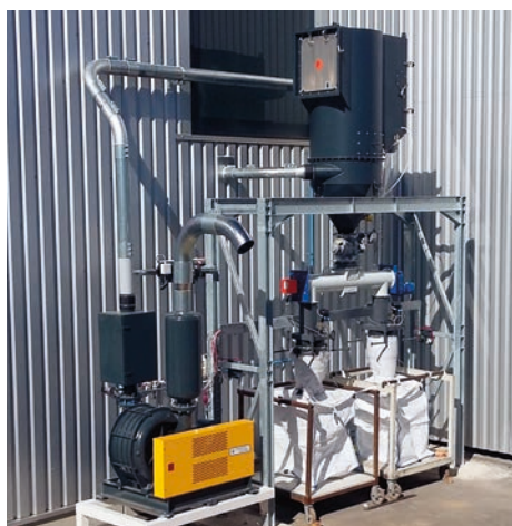
Extraction and filtration unit

Cleaning of ground coffee encapsulation lines