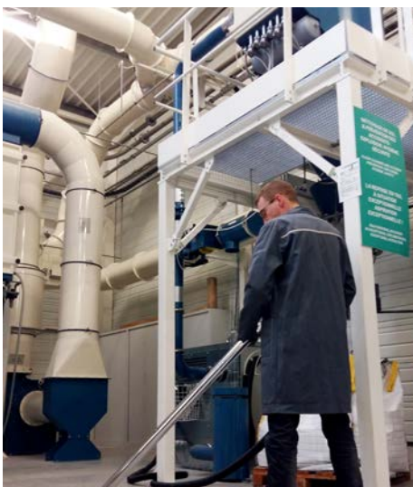
Centralised vacuum cleaning

Solution to clean factory floors and for the continuous extraction of waste products.