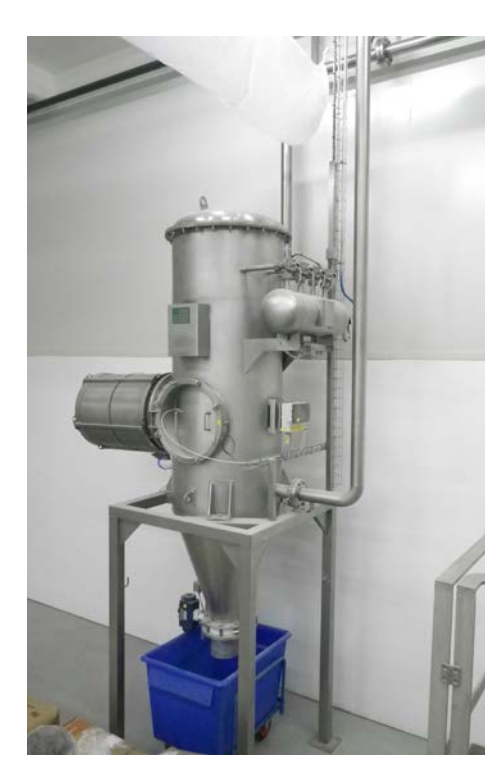
ATEX Bag filter in stainless steel