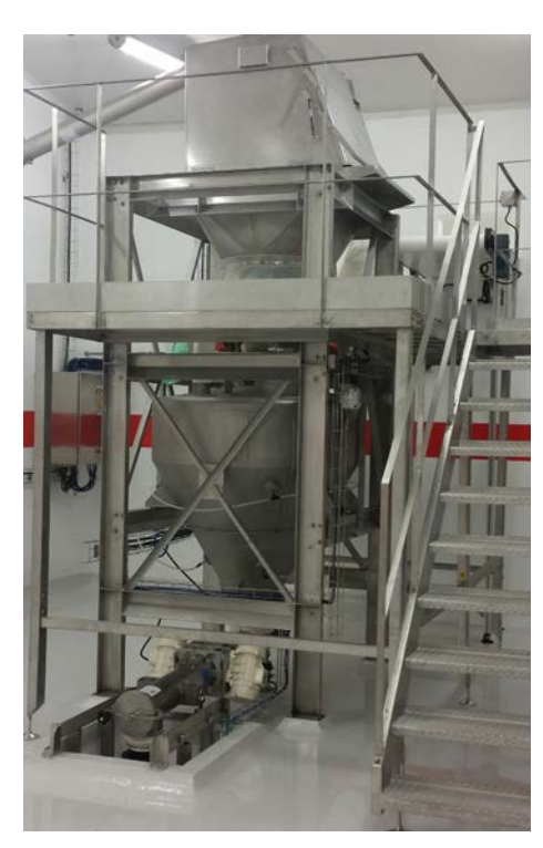
Sieving station for mixer feeding

Parc d'activités de la Houssoye Rue Ampère F59930 La Chapelle d'Armentières - FRANCE Tel: +33 (0)3 20 10 50 50 Mail: contact-process@neujkf.com